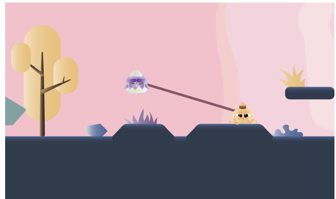
Figure 1: In one version of our Eggventures game, a rubber band ties together the two player characters. Players have to make use of it to catapult each other through the levels.

how input mechanics influence connectedness through a study of a cooperative platforming game. In our Eggventures game (shown in Figure 1), pairs of players could either independently traverse the levels or were tied together with a rubber band and then needed to make use of a catapulting mechanic during play. We compare the two variants in a between-subjects study and find that the rubber band mechanic was more challenging for the players, but in turn increased how much they communicated and consequently also their feeling of connectedness.