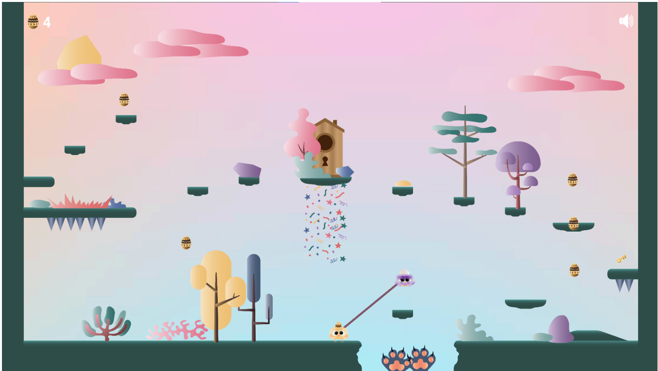
Figure 2: A screenshot of the fourth level of Eggventures. It shows all elements of the game: static and moving platforms, pits and spikes, a key and eggs to collect, and the birdhouse that marks the exit. Players control the two birds and have to jump and catapult each other via a connecting rubber band to traverse the level.